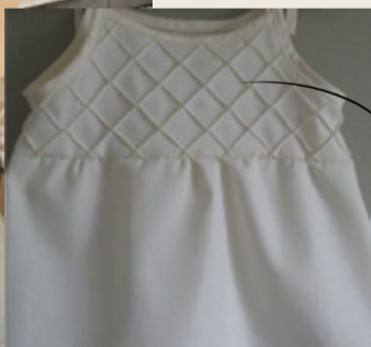
Pin Tuck used for the yoke