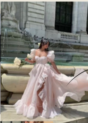
Wrapped skirt with frills